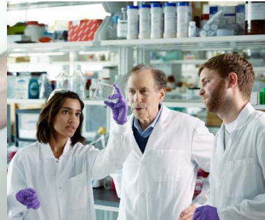
Director, International Co-operation