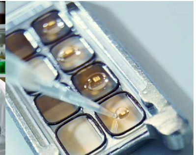
29 March 2017